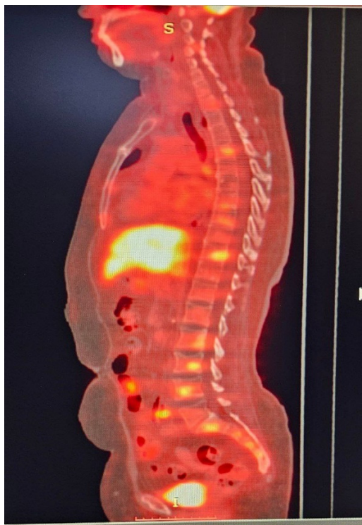
PET SCAN shows liver & bone metastasis