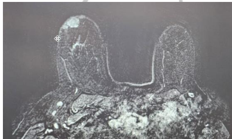
Breast MRI shows right breast lesions