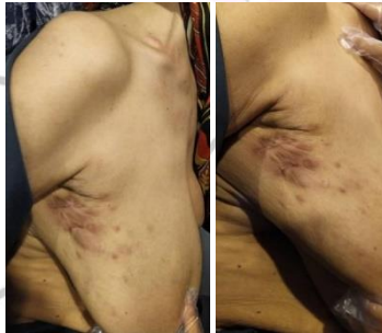
Figure 1 & 2: Right breast mass and supraclavicular lymphadenopathy.