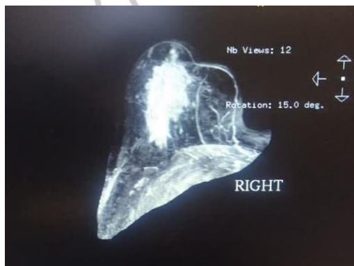
Figure 1: MRI shows non mass enhancement.