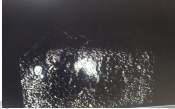
Figure2: MRI shows involved Axillary lymph nodes.