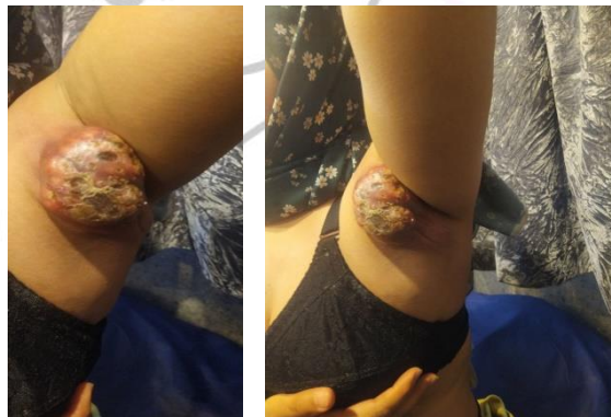
Figure 1 & 2: Left axillary mass.