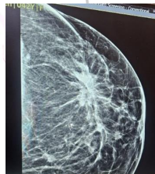
Figure 2: Mammogram shows left breast mass.