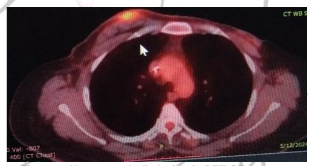
Figure 2: Hyper metabolic lesion in PET-CT scan.