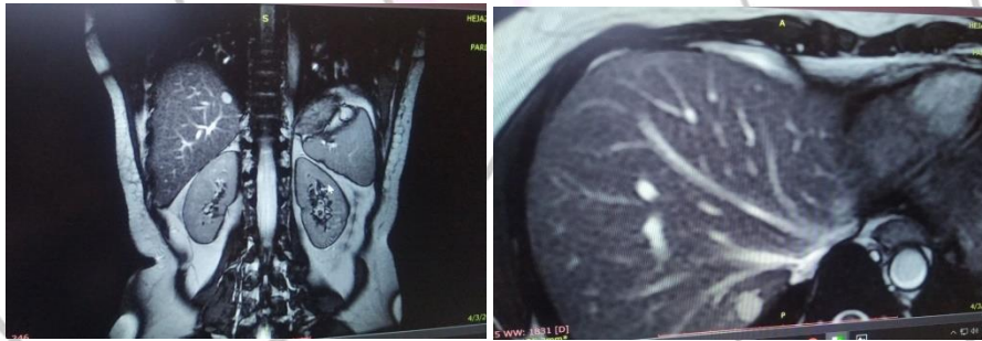
Figure 1 & 2: Liver lesions (Probably benign).