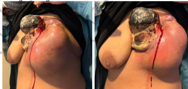
Figure 2 & 3: Necrotic breast mass.