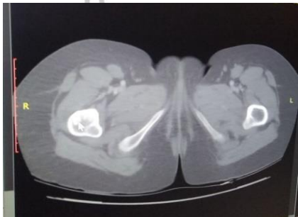
Figure1: CT scan shows metastasis in femur.