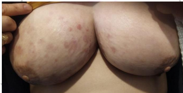
Figure 1: Shows skin nodules.