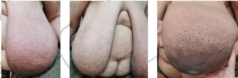
Figure 1, 2 & 3: Skin lesion.