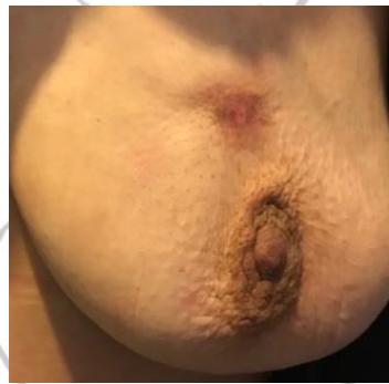
Figure1: Breast mass.