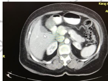
Figure 3: Remnant of Gallbladder.