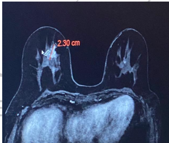
Figure 2: MRI shows breast mass.