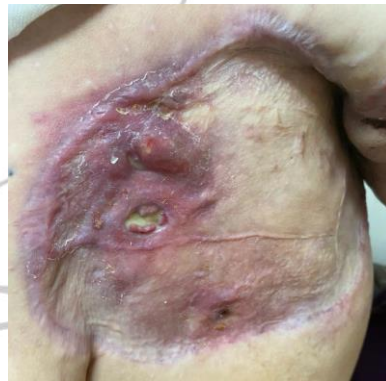
Figure2: After second surgery, recurrence.