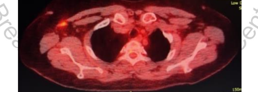
Figure2: PET scan shows Breast and Lymph node.