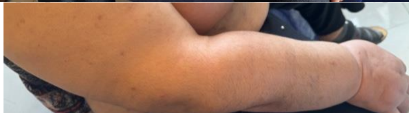
Figure 2 & 3: Lymphedema of upper limb.