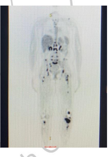
Figure1: Multiple Bone and Axillary METs on PET scan.