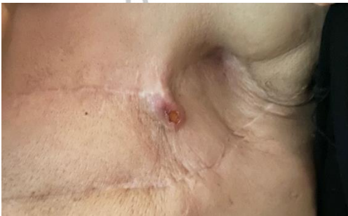
Figure1: Local recurrence.