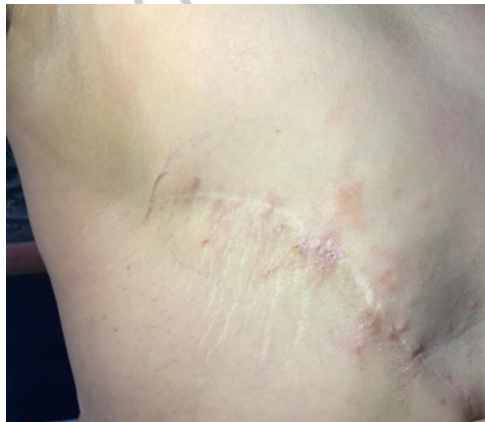
Figure 1, Recurrence as Skin Lesions.