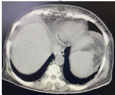
Figure1: Meningeal thickening (probably Mets)

Imaging review revealed Multiple Multi-organ metastases.