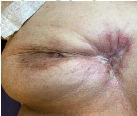
Figure 1: Ulcerative Breast Lesion Post history