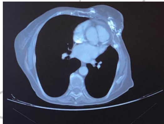
Figure2: Chest wall Lesion