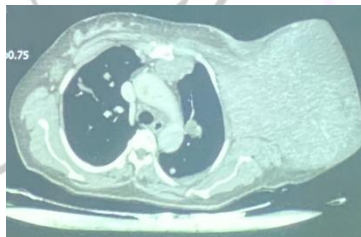
Figure2: Chest wall involvement