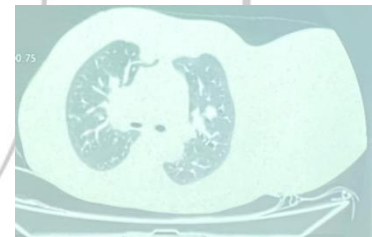
Figure3: Lung Metastasis

پژوهشگاه تحقیقات سرطان مركز Breast Disease Research Centre