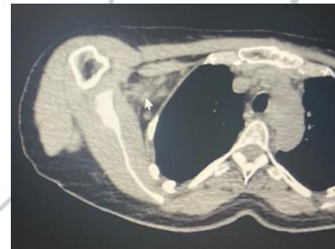
Figure 2, 3: CT scan.