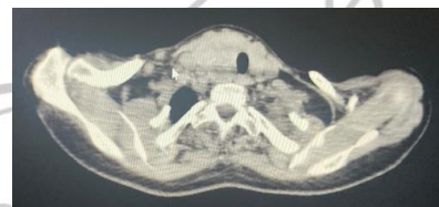
Figure 4, 5, and 6: CT scan.