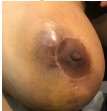
Figure 1: Breast mass.