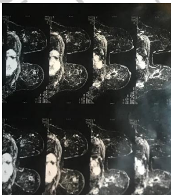
Figure 4: Lateral view of Breast MRI.