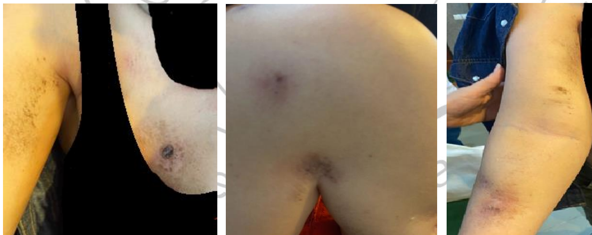
Figure 1, 2, and 3: Breast, back and upper extremity lesions