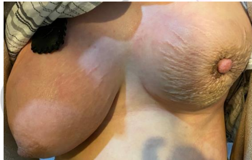
Figure1: Bilateral breast cancer