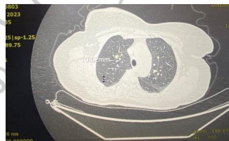
Figure 3, CT scan shows suspicious lung nodule