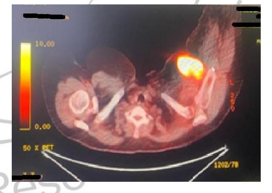
Figure1: CT scan, Chest wall penetration